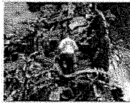
Clues sought in deadly jet ...