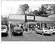
Dunkin' Donuts joins ...