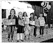
New spelling bee gives ...